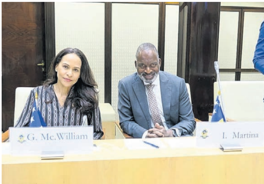
Diahuebs ultimo parlamento di Corsou a debata riba e carta cu Minister di finansa sr Sylvania a manda parlamento. E carta aki su contenido tabata

un peticion di minister na nomber di Consejo di Minister pa ratifica e acuerdo politico entre Gobierno di Corsou y Hulanda esta yama Landspakket.